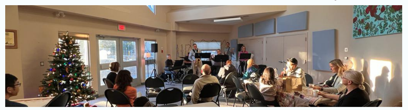
Winter Warm Up at the Hall, Dec 2023

The Official Newsletter of the Windsor Park Community