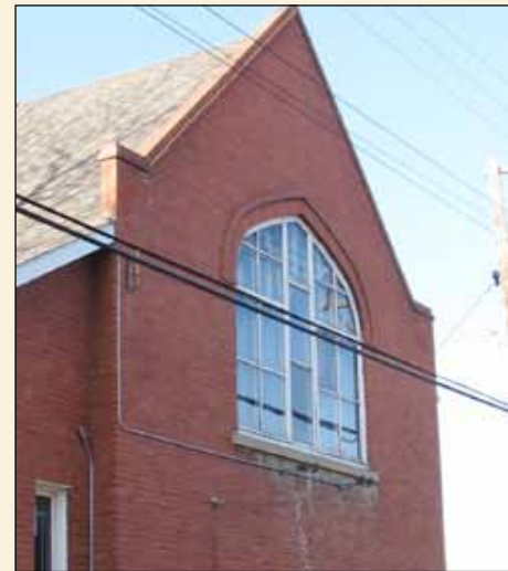
View of the rear façade in 2010 before the removal of the windows.

Tudor period specifically architecture of the English countryside between the year 1485 and 1547. Tudor Revival focuses on 'simple rustic' and less impressive aspects of Tudor architecture imitating medieval cottages and country homes in particular. Throughout Canada, Tudor revival architecture is most commonly applied to small residential architecture from about 1900. This is a rare example of its application to religious buildings.