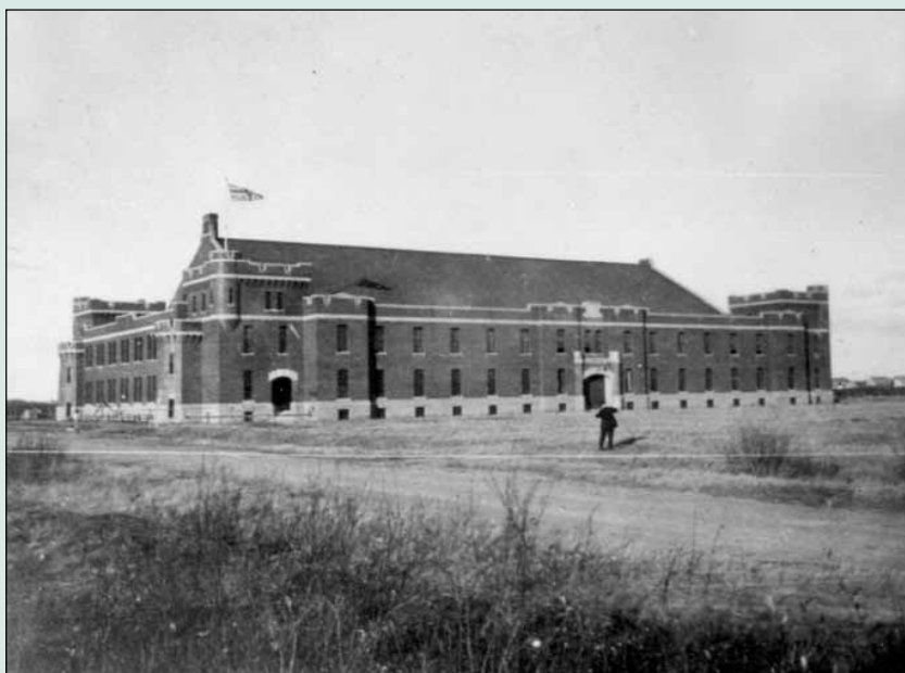
A man stands in front of the Armouries ca. 1915 in one of the archives’ earliest photos of the building.