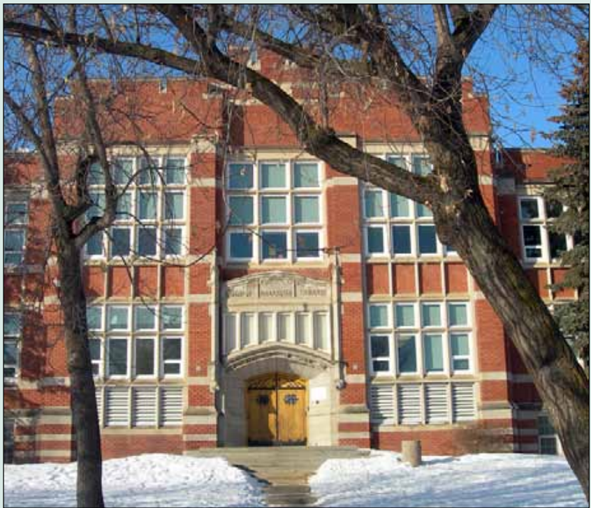
Front entrance of John A. McDougall School in 2010.