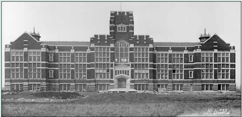
John A. McDougall School after construction in 1914.