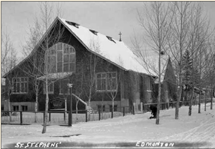
View of St. Stephen the Martyr Anglican Church c. 1940.