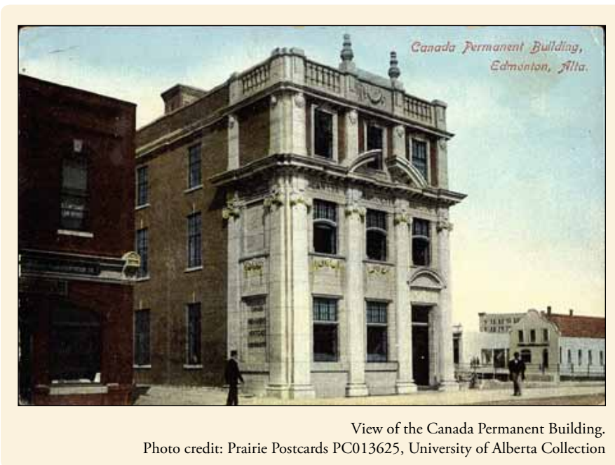
View of the Canada Permanent Building.

The Canada Permanent Building has survived multiple owners, a use transi-