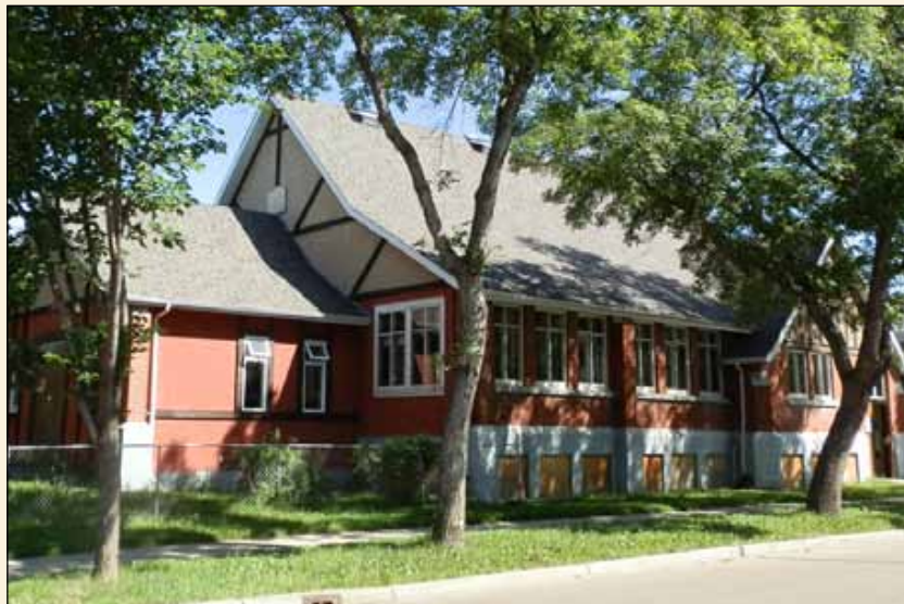
View of St. Stephen the Martyr Anglican Church from the street with vestibule, August 2012.