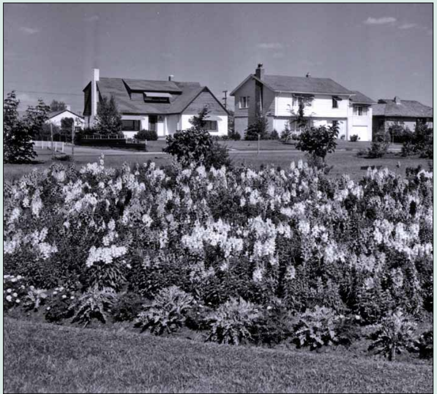
Landscaped flower beds in Windsor Park in 1958 looking towards Windsor Road.

For the next 40 years, the “park-like circle” lay dormant, a “bare, grassy area” according to one laconic