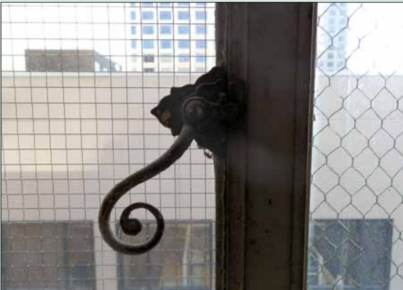
View of Decorative Handles on Steel Frame Windows, 2012.

of the insurance building remain. These include the original art nouveau inspired balustrade, the steel frame windows with locking decorative handles and some small fragments of crown moldings and coffered ceilings.