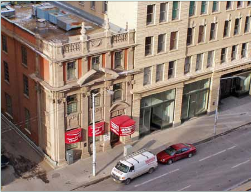
View of the Canada Permanent Building c. 1980.