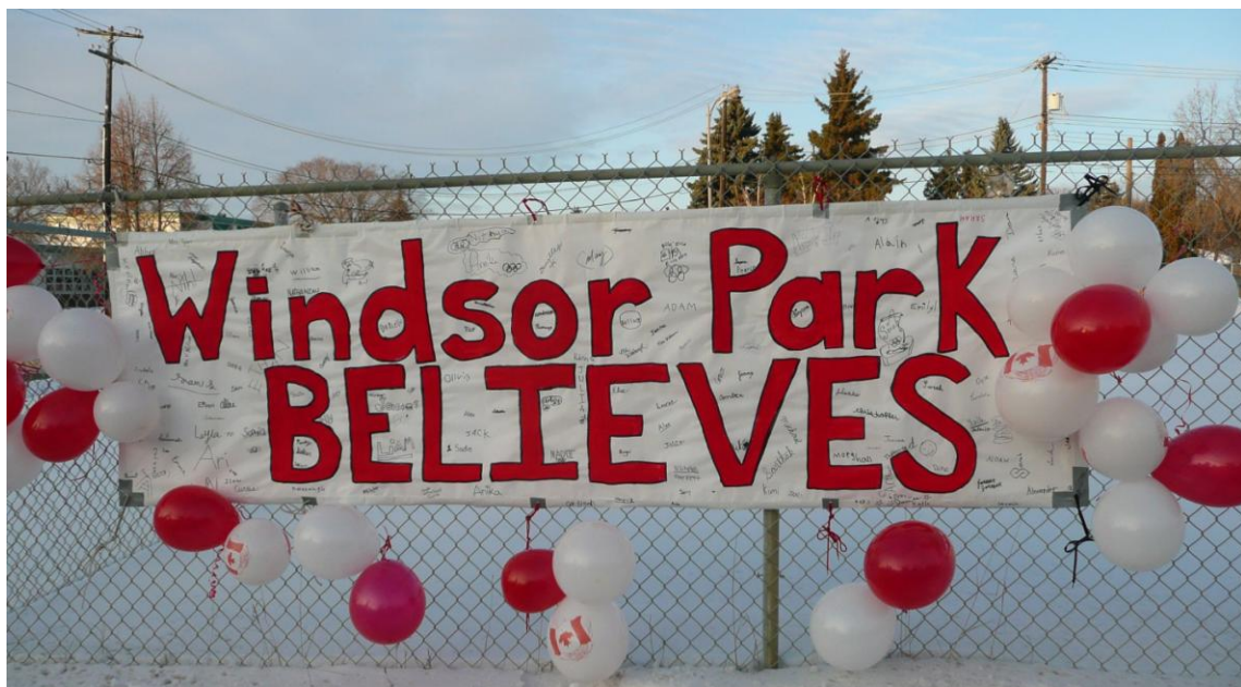
Windsor Park School Poster for the Olympic Torch Run through Windsor Park